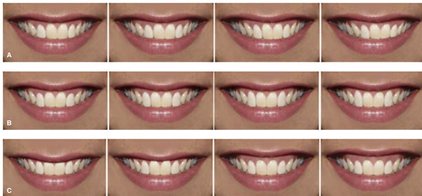
Figure 2. A) Modifications for «midline». B) Modifications for «gingival margin». C) Modifications for «gingival exposure».