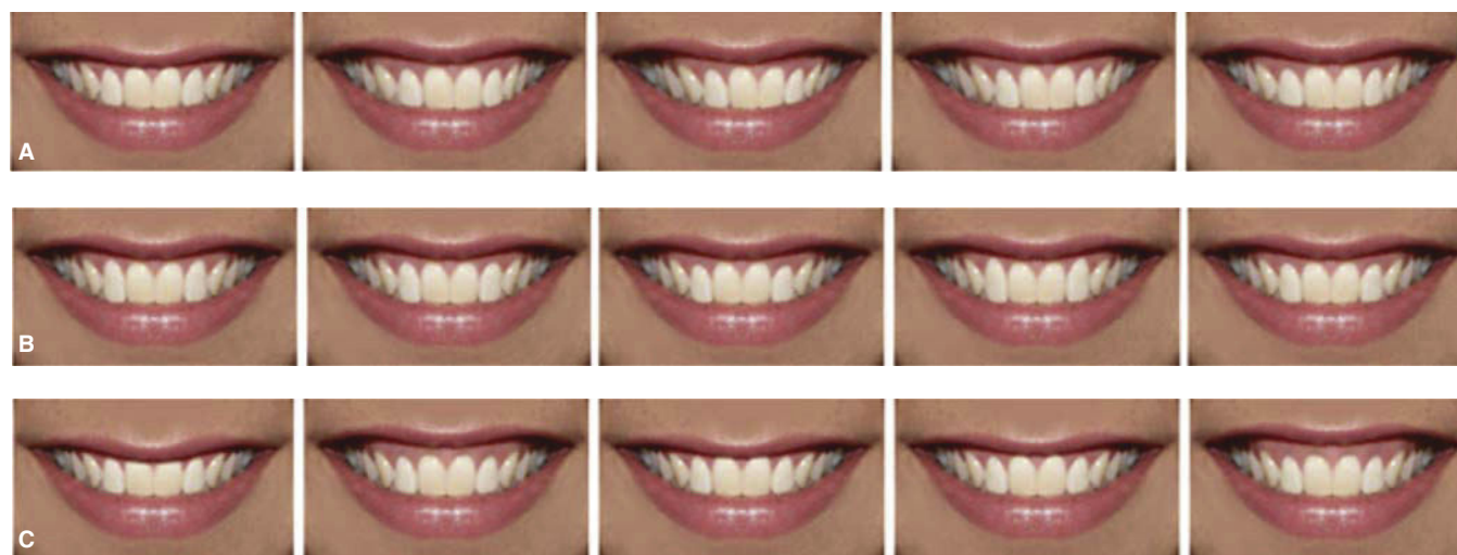
Figure 3. Modifications for each parameter placed in random order. «A)» Midline. «B)» Gingival margin. «C)» Gingival exposure.

used. We compared the aesthetics perception between the two groups by means of the non-parametric Mann-Whitney test. The Kruskal-Wallis test was used to compare the perception among specialties. The level of significance was regarded as \leq 0.05 .