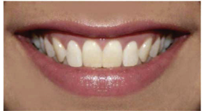
Figure 1. Photograph of a smile with normal aesthetic parameters.

Midline: four images were designed with a deviation of the dental midline ranging from 1 mm up to 4 mm to the right. Gingival margin: four images were designed with differences in the height of the gingival margin between central and lateral incisors. The differences were: margin of the lateral incisors 2 mm below the margin of the central incisor, lateral incisor's margin at the same height as the central incisor's margin, margin of the lateral incisors 1 mm above the margin of the