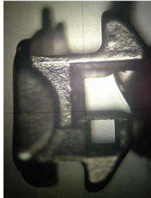
Figure 2. Bracket In-Ovation®.

Cash et al observed that all the slots in the brackets they examined were increased from 5 to 24%, which was the most comprehensive variation. In our study, we found that all self-ligating brackets have slots with larger dimensions than the ideal (0.022"); the bracket