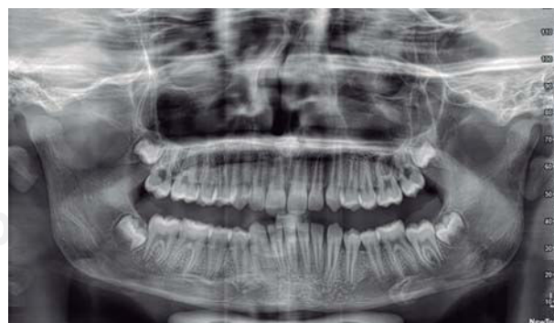
Figure 4. Initial panoramic radiograph.

In the final panoramic X-ray end an acceptable root parallelism may be observed. Upper and lower fixed retention was placed ( Figures 6 to 9 ).