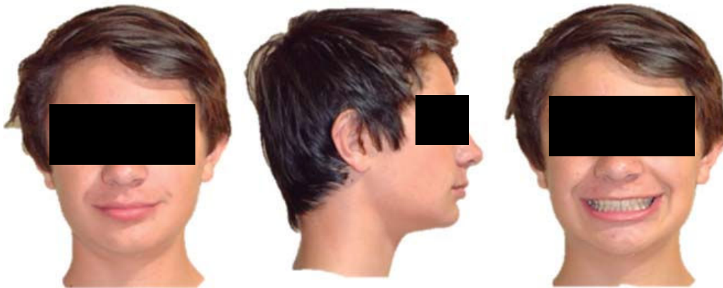
Figure 6. Final facial photographs.