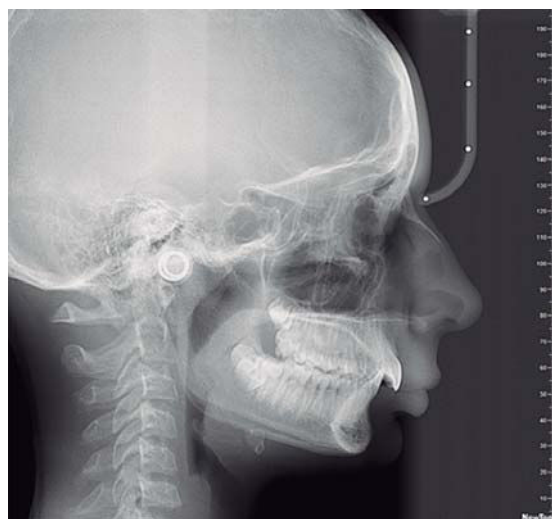
Figure 3. Initial lateral headfilm.