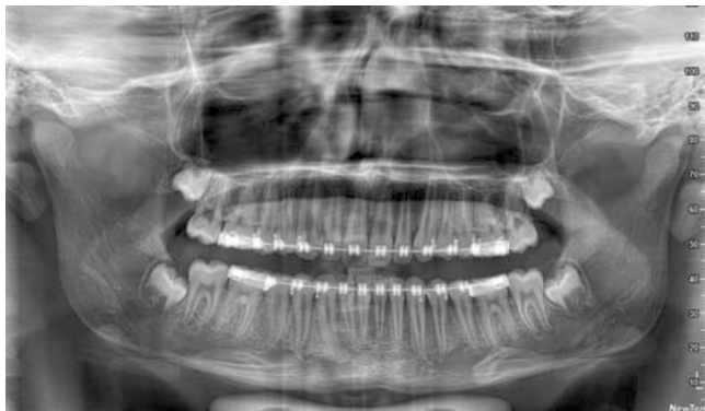
Figure 9. Final panoramic radiograph.

closure of irregular interdental spaces was achieved as well as dental Class I molar relationship without undesirable effects.