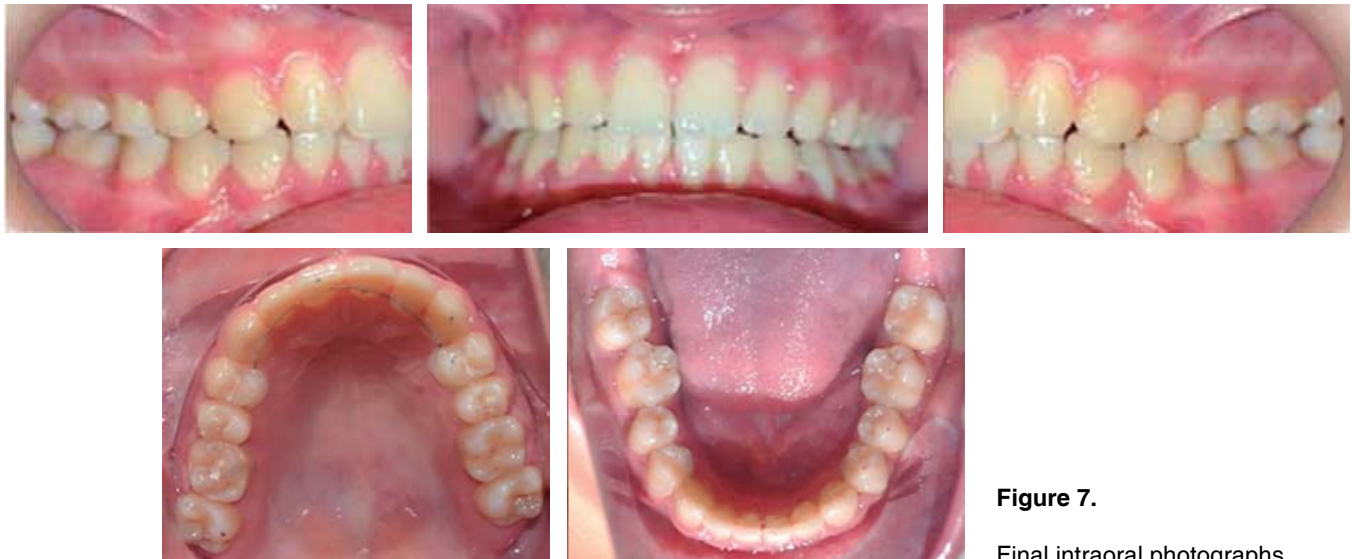
Figure 7. Final intraoral photographs.

resulting in root parallelism and reducing undesirable movements.