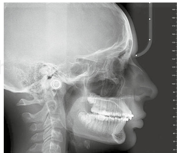
Figure 8. Final lateral headfilm.

Performing a correct diagnosis will result in an effective treatment plan guiding the specialist to take a wise decision for the benefit of the patient. In this case,