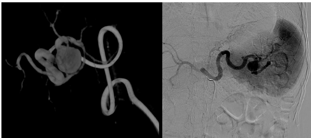
Figure 1 Angiographic study confirming fusiform dilatation located in the distal third of the splenic artery.

Nevertheless, it must not be underestimated that about 2–10% of aneurysms begin with spontaneous rupture. 3 In these cases, patients present acute pain in the epigastrium, left hypochondrium, left shoulder (Kehr's sign) and haemodynamic instability. The haemorrhage may stop in the epiploic transcavity or move from Winslow's hiatus to