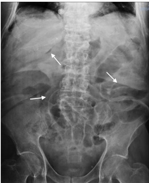
Figure 1 Plain abdominal X-ray: the double wall sign and pneumoperitoneum can be seen.