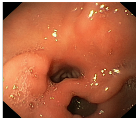
Figure 2 Two openings connecting the lesser curvature of the gastric antrum and the duodenal bulb, consistent with a double pylorus.

Endoscopic follow-up two months later showed two openings connecting the gastric antrum and the duodenal bulb (Fig. 2), separated by a tissue septum. The scope could enter the bulb through both openings. The findings were consistent with an acquired double pylorus from a duodenal ulcer complication. Helicobacter pylori colonisation was not found on histology of gastric biopsies.