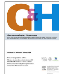
IMAGE OF THE MONTH