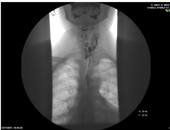
Figure 1 Diverticulum in close relationship with the osteosynthesis plate.

We present a case of a 58 years-old female with no past medical history but several cervical spine surgeries due to a traumatic cervical fracture and later on due to pseudoarthrosis of the osteosynthesis plate. The patient refers