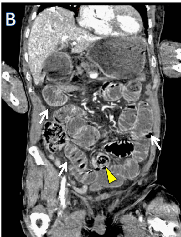
Figure 3 Abdominal CT axial and coronal showing small bowel loops distension (arrows) and an oval formation in a distal jejunal bowel loop.