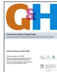
IMAGE OF THE MONTH