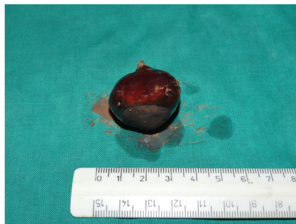
Figure 4 The foreign body (a chestnut) evacuated by the patient.

any therapeutic measure and, despite its size, passed the ileocecal valve that is frequent site of obstruction.