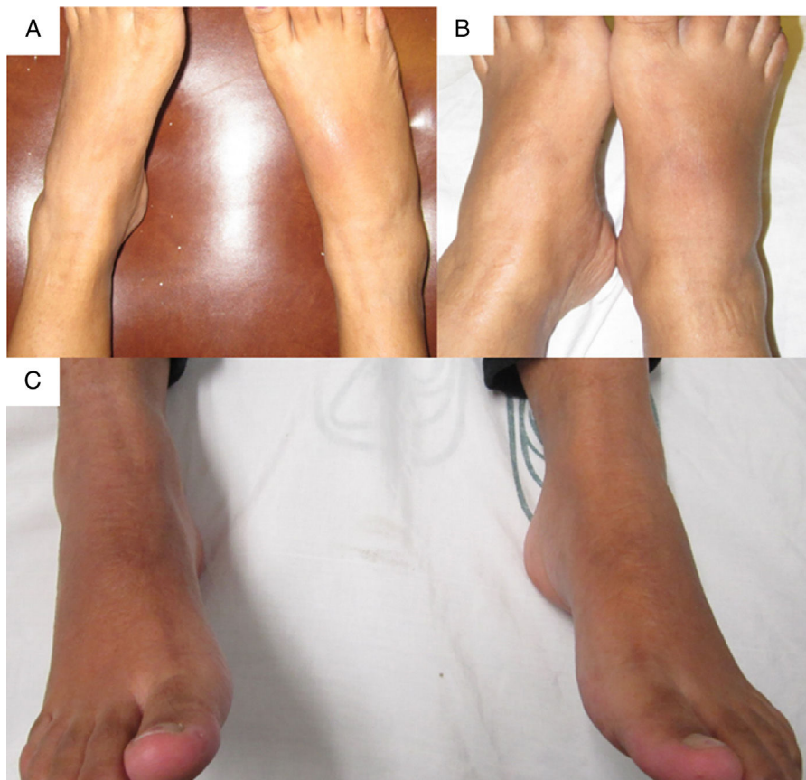
Fig. 1 – (A and B) AP view of the right foot, which shows an increase in volume of the tarsus and ankle, erythema in the right tarsus. (C) AP view after the infiltration of intra-articular dexamethasone.

At 23 GW she presented arthritis in the left ankle; traces of proteins were documented in the urinalysis; the patient was treated with 80 mg of intramuscular methylprednisolone acetate in a single dose and colchicine 1 mg/day, ibuprofen 200 mg every 6 h for necessary reason and prednisone 10 mg/day were started, with which remission of the arthritis was achieved. By recommendation of the obstetrician-gynecologist, she suspended the prednisone and colchicine at 34 GW. At 37.3 GW a male newborn of 2900 g, length 48 cm, Apgar 9/9, Silverman-Anderson test 0, was obtained by cesarean section. 24 h after giving birth, the mother presented arthritis in the right ankle, which was treated with ketorolac 30 mg intravenously every 8 h, with symptomatic improvement and continued with prednisone 5 mg/day. At 3