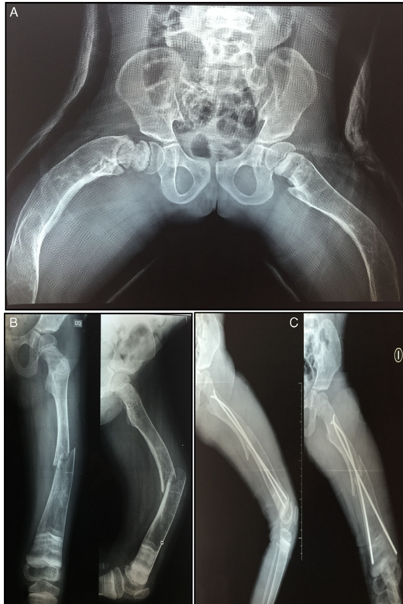
Fig. 2 – (A) Hip and lower extremities deformity, (B) diaphyseal fracture of the left femur, and (C) surgical correction of left femur fracture.

So far the patient has received three doses of denosumab with intervals of 6 months between each dose with satisfactory results, improving her quality of life significantly.