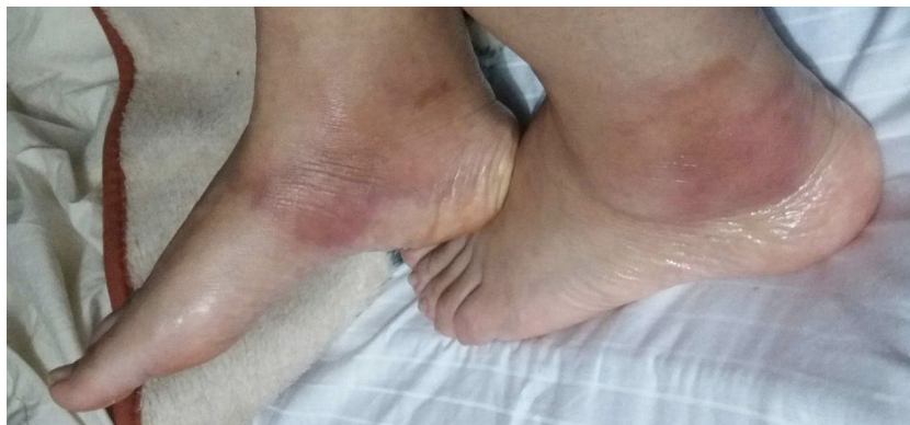
Fig. 1 – Flat, nodular, violaceous and indurated lesions, painful to palpation and of irregular surface, located in the inner portion of lower limbs associated with perimalleolar edema.

Despite the high doses of analgesics, the patient persisted with intense pain in the lower limbs and limitation of the secondary gait; it was requested a comparative MRI of lower