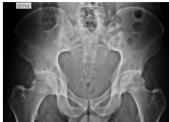
Fig. 1 – Anteroposterior projection of the pelvis showing changes of enthesopathy and bilateral grade III sacroiliitis, confirming the diagnosis of ankylosing spondylitis.

The renal biopsy showed intraglomerular congophilic deposits, in the absence of immunoglobulins or other