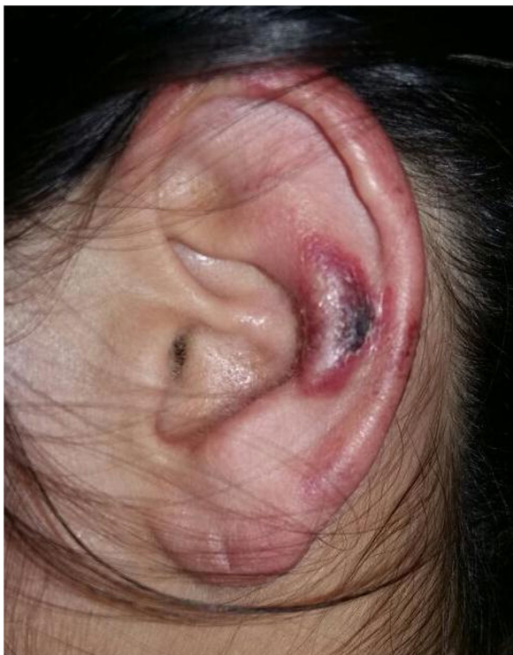
Fig. 5 – Ear necrosis.

impact has been described as a social consequence of the financial, political and social crisis that lead large numbers of Argentinians to poverty and marginal status. 6