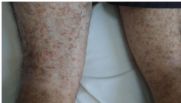
Fig. 3 – Nasal septum perforation.

Case 5: A 34-year-old male who came to consultation with bleeding gums, fever, testicular pain, purpuric lesions in lower limbs and hematuric urine. Renal biopsy: mesangiocapillary glomerulonephritis with IgG and IgM deposits. Suspected diagnosis: polyarteritis nodosa and vasculitis secondary to cocaine addiction. He was treated with steroids in bolus and intra-venous cyclophosphamide. The patient admitted cocaine addiction. After 7 months of treatment, the patient developed obstructive respiratory failure due to tonsil enlargement (Candida infection) and died.