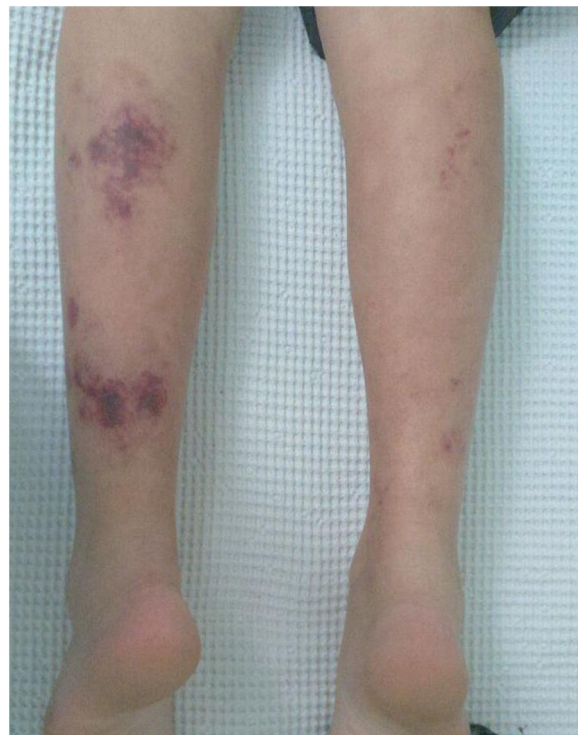
Fig. 4 – Cutaneous necrosis in lower limbs.

Case 9: A 25-year-old woman hospitalized because of cheek purpuric lesions, cutaneous and ear necrosis, spleen enlargement, fever and alveolar hemorrhage. Positive ANA 1/200 homogeneous pattern (HeP-2 by ELISA), positive P-ANCA