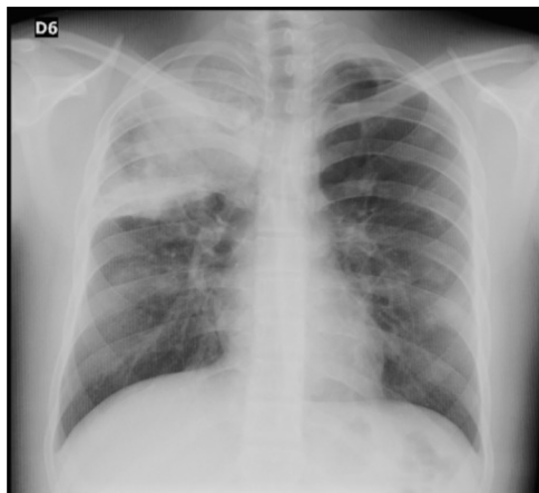
Fig. 1 – Chest X-ray, PA projection: signs of pulmonary consolidation involving the entire right apex.