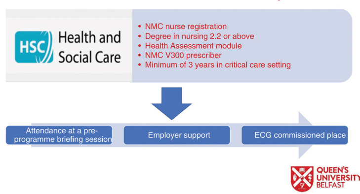
Figure 2 Illustration of the pre-requisites which were deemed necessary for selection and recruitment of potential trainees.