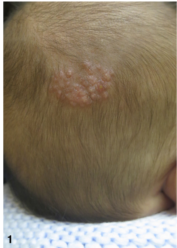
Fig. 1. Verrucous plaque formed by multiple papules of pseudocystic appearance and follicular distribution, located in the right parieto-occipital region.

The histological study revealed the presence of follicular epithelium lobes open at the skin surface which penetrated the dermis (Fig. 2A). We were able to observe the typical inclusion bodies in the cytoplasm of the keratinocytes, which increased in size from the basal layers to the more superficial layers of the epidermis, in turn increasing their basophilia. This resulted in a diagnosis of molluscum contagiosum viral infection (Fig. 2B). The follicular distribution of the infection was striking, with lesions observed only in