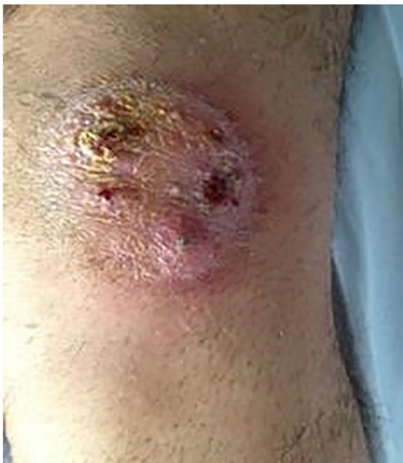
Fig. 1. Infected left knee lesion with desquamating borders.

This was a 42-year-old patient with no relevant medical history who came to the hospital with a skin lesion on the left leg and feeling shivery. He reported the appearance, two months earlier, of a non-pruritic, scaly erythematous plaque on his left knee. On examination, an infected rounded plaque with desquamating borders was found on the lateral aspect of the left knee with several abscessed points, as well as signs of cellulitis and lymphangitis in the thigh (Fig. 1). Several hard, mobile and painful enlarged lymph nodes were found in the left inguinal region. The patient lived in the country in contact with cows, goats and horses, and reported falling off a horse onto brambles. After prescribing IV treatment with amoxicillin-clavulanic acid, the patient was admitted to the