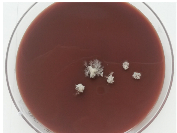
Fig. 2. Cerebriform colonies of T. verrucosum in chocolate agar after 10 days of incubation at 37 °C.

After 7–10 days of incubation, the pure growth of a filamentous fungus forming creamy cerebriform colonies was observed in the cultures of exudate, abscess and biopsy from the patient's knee lesion in chocolate agar medium and blood agar at 37 °C (Fig. 2). The antibiotic treatment was therefore discontinued and treatment with oral terbinafine was prescribed. Days later, growth was observed in Sabouraud medium with chloramphenicol and gentamicin at 30 °C. Microscopic examination showed hyphae with chandelier appearance, absence of macroconidia and microconidia, and the presence of long chains of compacted chlamydoconidia suggestive of Trichophyton verrucosum (Fig. 3). The histological study showed an inflammatory process in the dermis with follicular destruction and presence of PAS-positive rounded structures, compatible with Majocchi granuloma. After six weeks of treatment, the lesion on the right tibia progressed to cellulitis with small pustular lesions and signs of lymphangitis. In the culture of one of the lesions, T. verrucosum was isolated again, with identification confirmed by the sequencing of the ITS region of the rRNA. Finally, after 12 weeks of treatment with terbinafine 250 mg/d, the lesions had